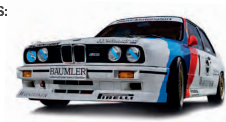
BMW E30 M3, 1992

Only the interplay of 40 years of racing experience, the most advanced art of engineering and highly skilled driving intuition can turn a BMW M3 into a BMW M3 DTM.